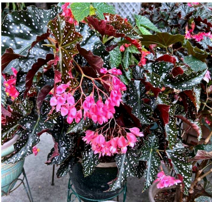
B. 'Cracklin' Rosie' Superba