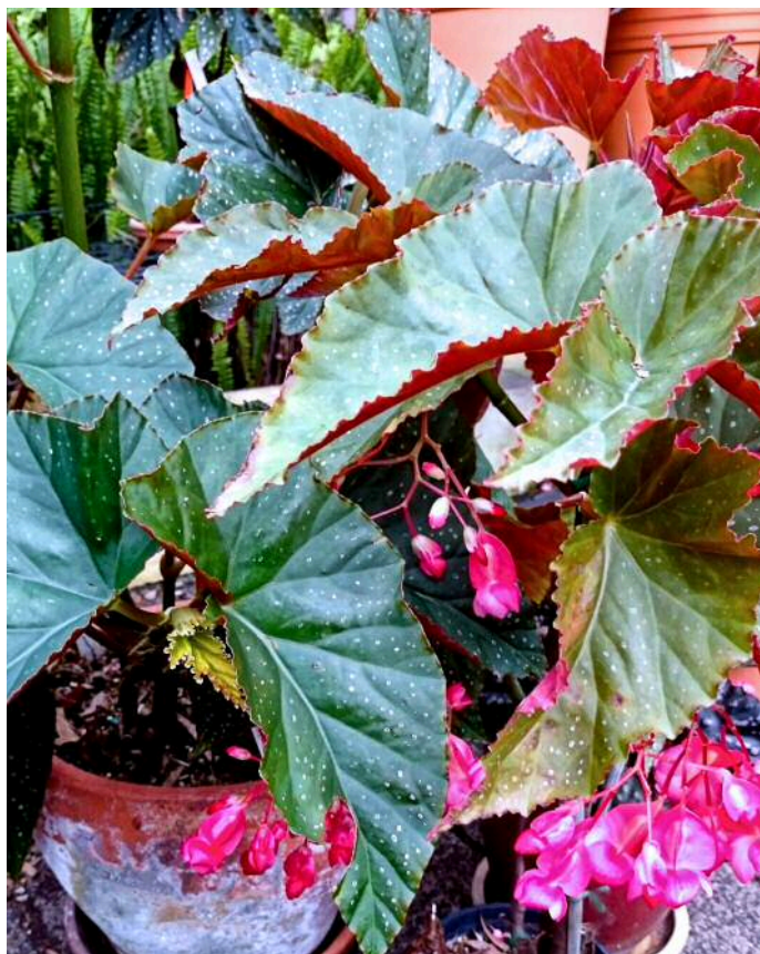
B. 'Corallina de Lucerna'