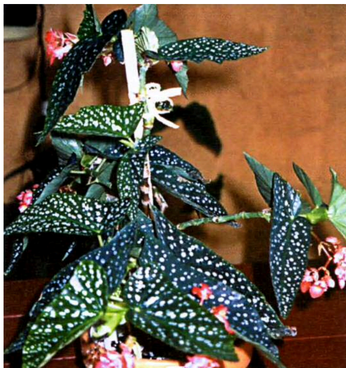
B. 'Peggy's Pet'