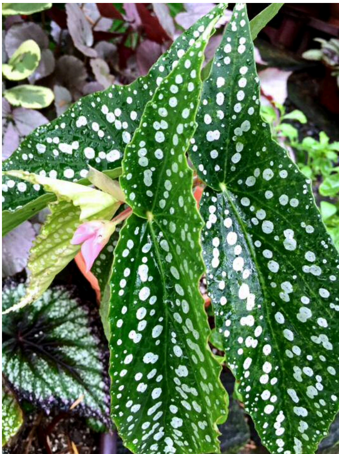
B. 'My Special Angel'