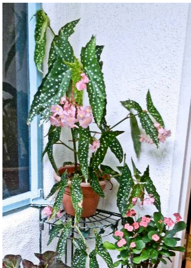
B. 'My Special Angel'