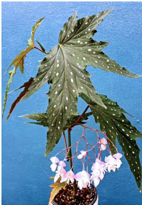
B. 'Mac Daddy'