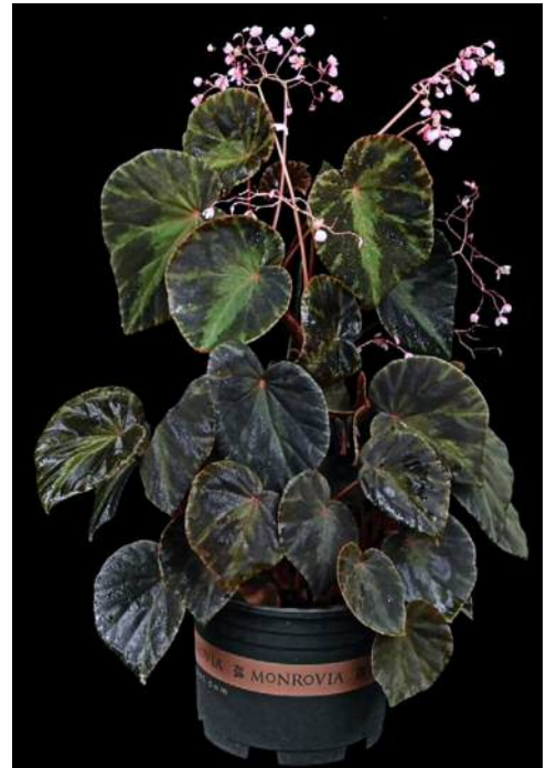
B. 'Black Magician'

Tyler, Texas August 26, 2023. Begonia 'Tiny Gem,' B. 'Cachuma,' B. dregei (partita variant), cleopatrae , coriacea , robusta are just a few mentioned in this new edition that arrived recently.