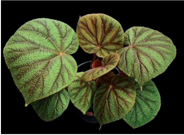
B. 'Hong Zhuang'

The Begonian for November/December describes six new begonias that have been registered and photographed: B. 'Black Magician,' B. 'Hong Zhuang,' B. 'Yi Xi,' B. 'Kimby,' B. 'Lamoon,' and B. 'Mac Daddy.'