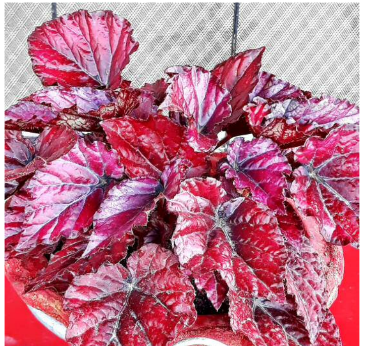
Begonia 'Red Bull' - India