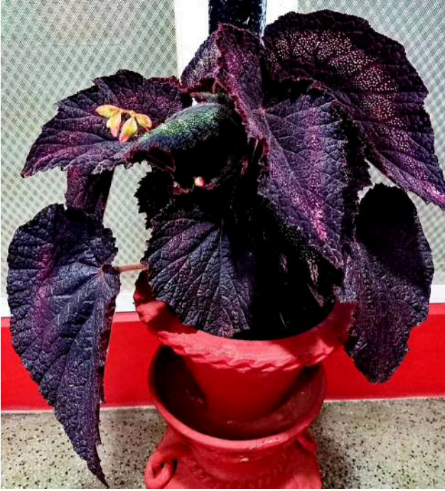
Begonia 'Black Knight' - India