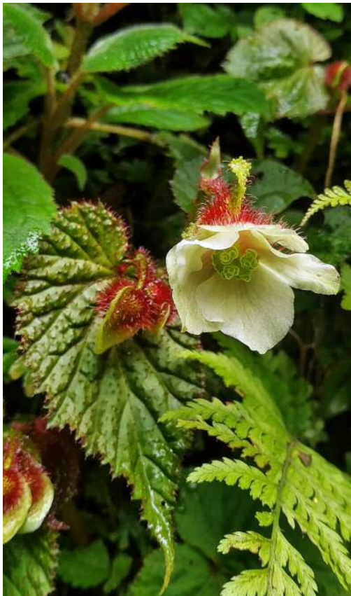
Begonia cathcartii - India