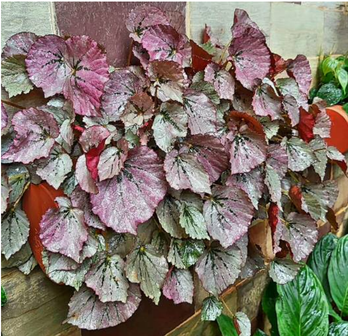
Begonia 'Martin's Mystery' - Mangalore, India