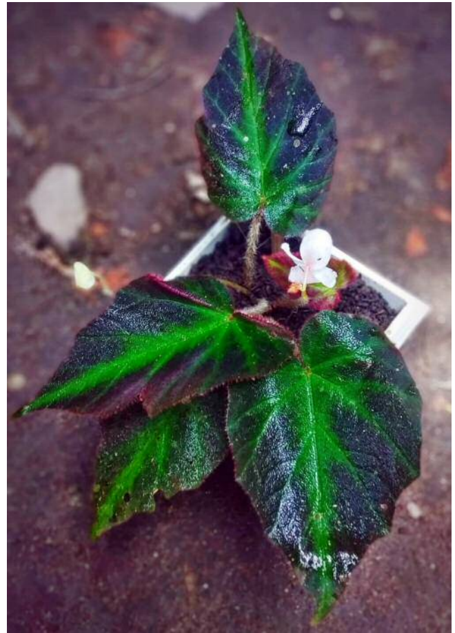
Begonia 'Sumatra Utara' - Indonesia