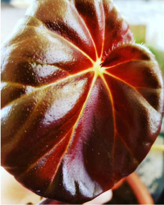
Begonia 'Red Fred' - Chicago