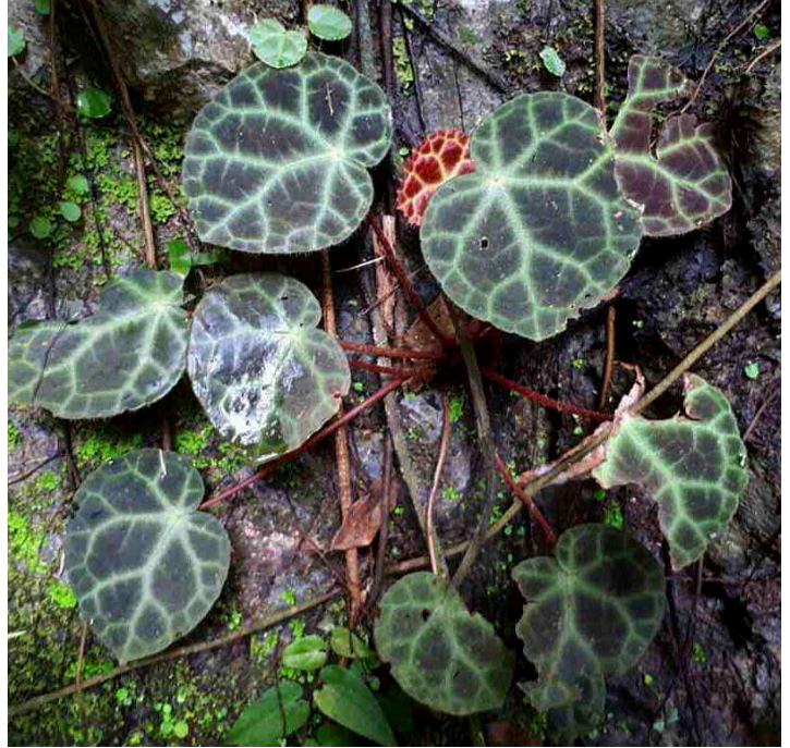
Begonia nurii - Malaysia