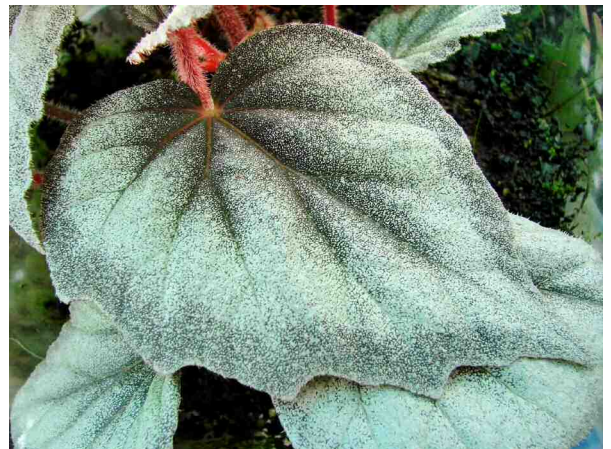
B. Rex 'Flamingo Soul'