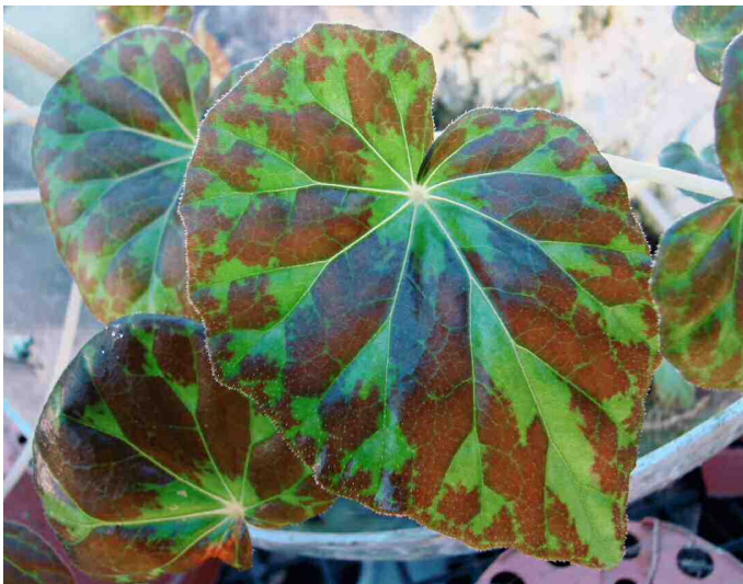
B. 'barsalouxiae'

Respectfully submitted, Nelda Moore, Secretary