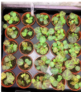
B. 'Rajah'