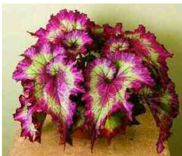
B. 'Raspberry'