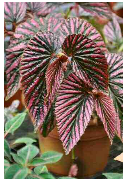
B. 'brevirimsa'