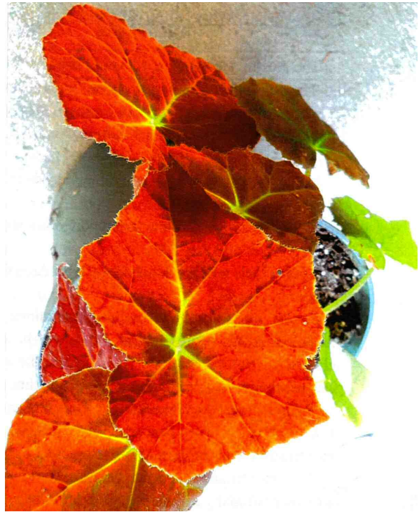
Begonia 'Autumn Embers'