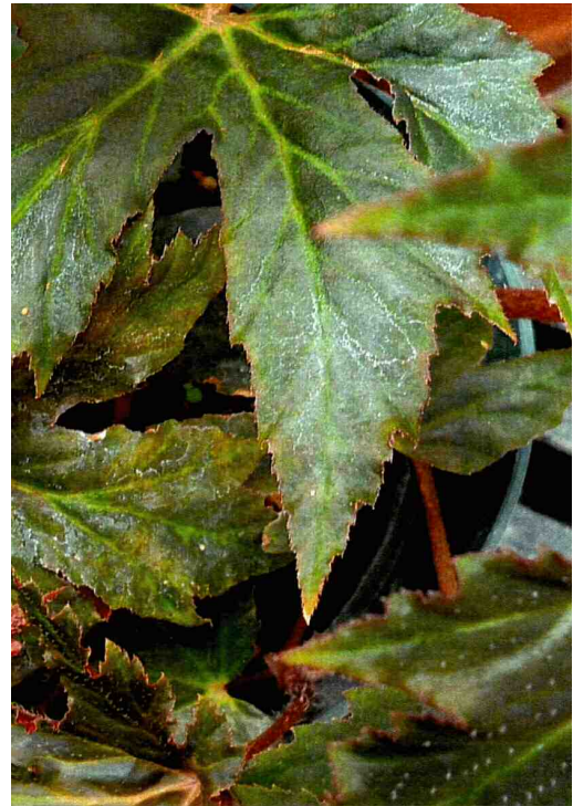
Begonia 'Earl ee bee'