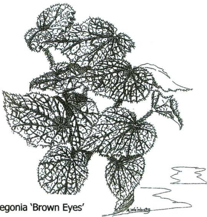
Begonia 'Brown Eyes'