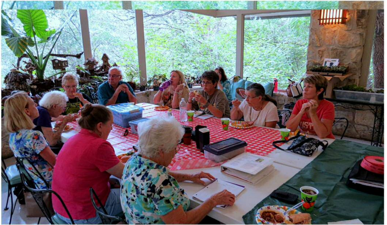
Members of the Austin Area Begonia Society Branch enjoy Pot Luck during the September meeting in the Greene Room of the Austin Area Garden Center.