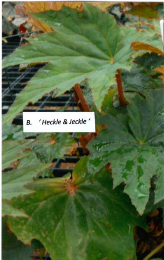
B. 'Heckle & Jeckle'