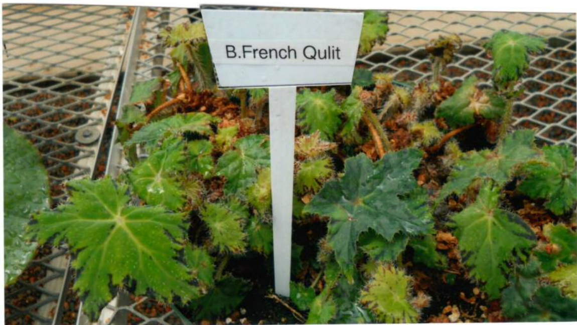
B. French Qulit