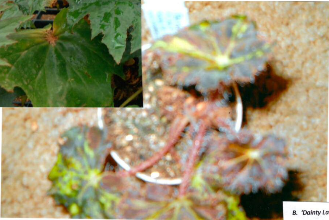
B. 'Dainty Lady'