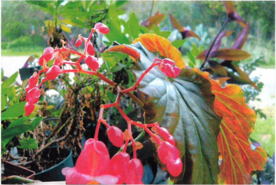
Begonia 'The Sultan' in bloom