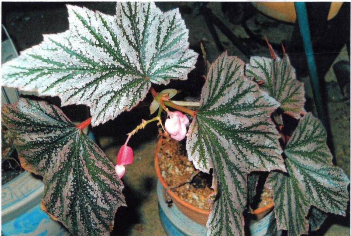
Begonia 'Pink Minks' in bloom